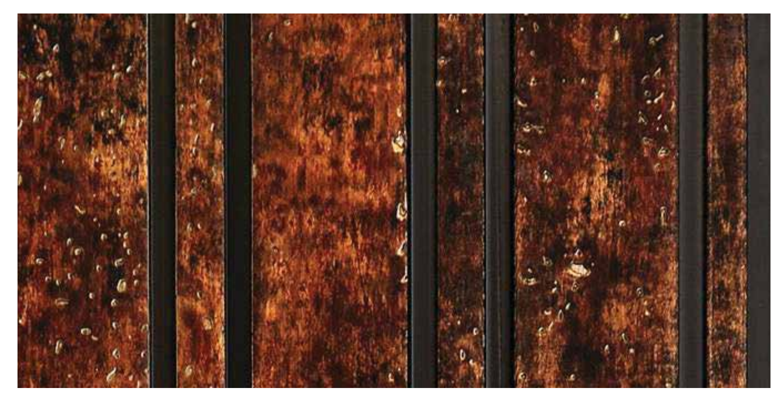
AP - 14112