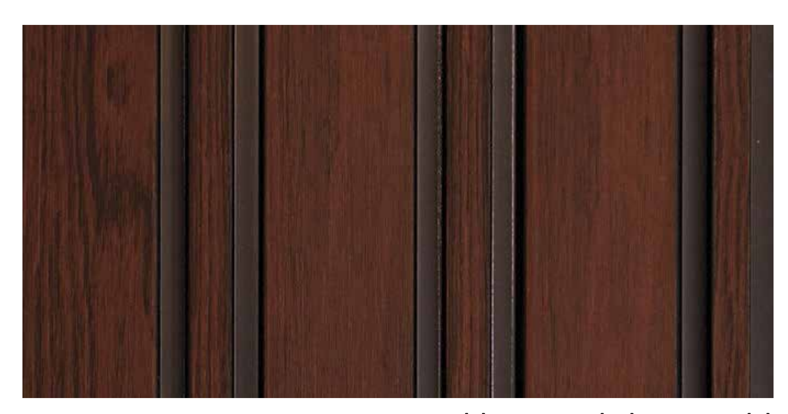
AP - 12111