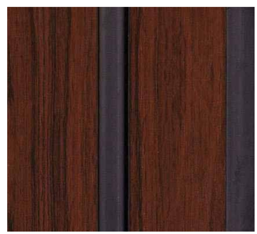
AP - 9212