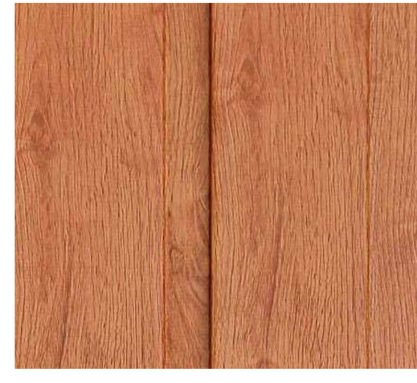
AP - 9112