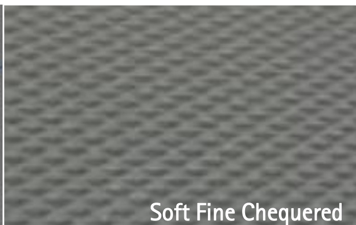
Soft Fine Chequered